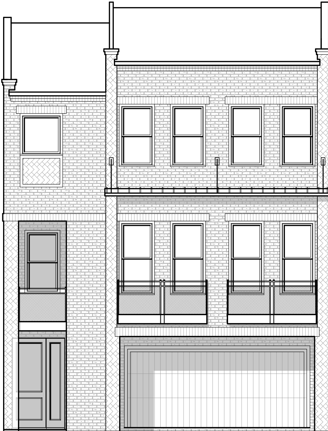
○ FRONT ELEV.